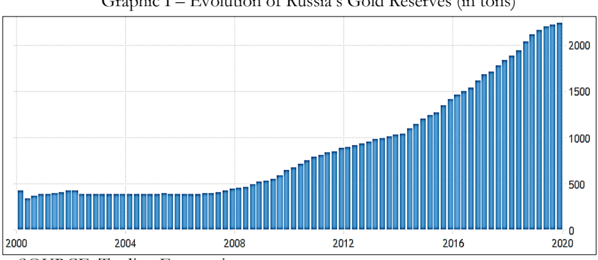
Graphic I - Evolution of Russia's Gold Reserves (in tons)

ev earned from the selling of US Debt was used by Moscow to buy Gold, thus "seeking to reduce its dependence on the U.S. dollar in the event of an extension of sanctions by the United States" (MOSCOW TIMES, 2019). The reported amount of Russia's Gold reserve exceeded 2,168 tons as of May 2019, whereas in 2018 alone Moscow bought around 274.3 tons of gold (ibidem).